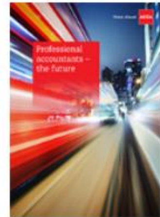
Professional accountants -the future