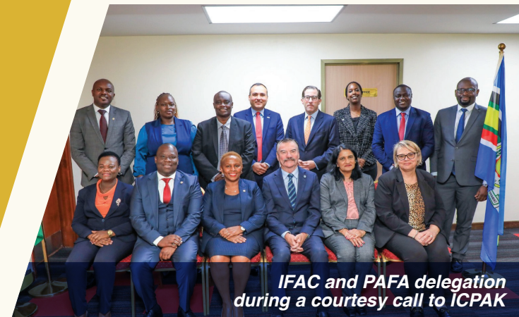
IFAC and PAFA delegation during a courtesy call to ICPAK