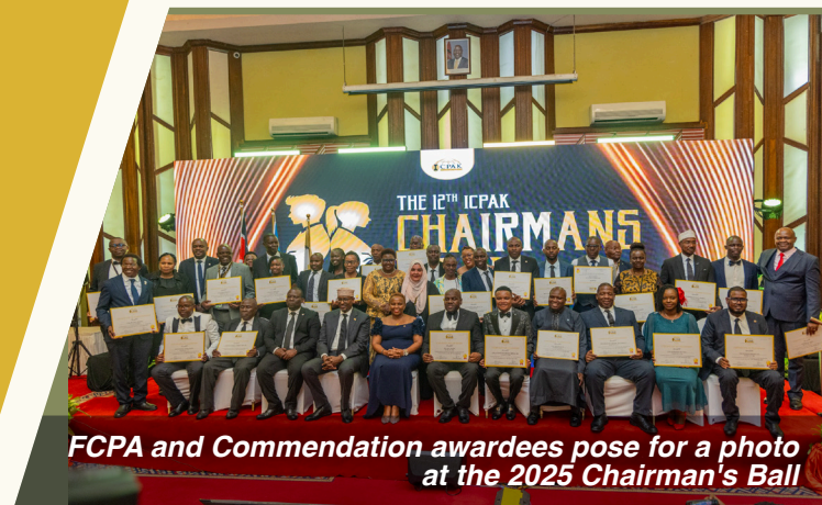
FCPA and Commendation awardees pose for a photo at the 2025 Chairman's Ball